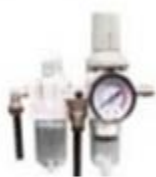
Air flow regulator with lubricator